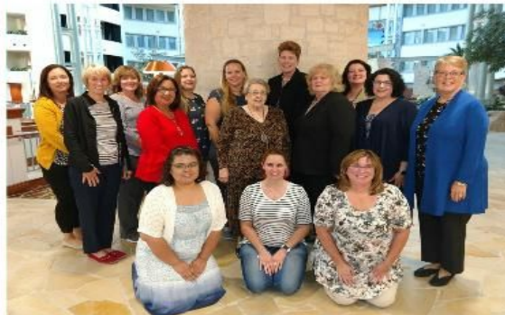
DKGNext members meet in Austin, TX

W hat are the Core Values of Delta Kappa Gamma? This important question was put to the test during a recent Think Tank weekend of DKGNext 2019. Comprised of 14 DKG members, this group was selected to represent a cross-section of the overall membership. Although DKG has a strong set of seven Purposes as well as a mission and vision statement that are regularly addressed, its Core Values have not been revisited in some time. Core Values are beliefs that guide an organization’s actions, unite its members, and define its brand. The DKG professional staff and international president guided the DKGNext 2019 team through a rigorous process by breaking down the seven Purposes and exploring characteristics that the model member embodies. The result was the establishment of five Core Values for our Society: collegiality, professional/personal growth, leadership, philanthropy/service, and international diversity.